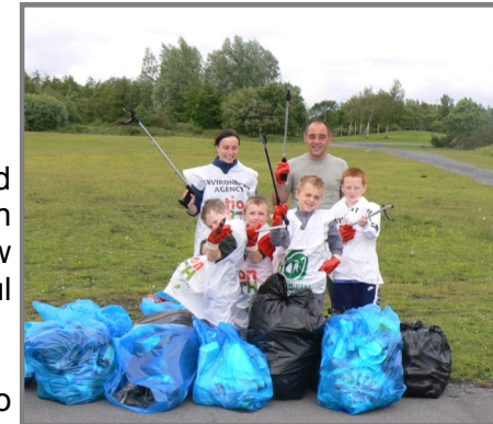
Some volunteers at a recent litter pick at Parc Melin Mynach

There is a wide range of opportunities so whatever your background, the skills or experience you have, there is something that you can do.